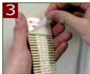
3 PUT ON RETURN (OUTSIDE MOUNT)