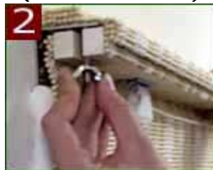
2 INSTALL SHADE (OUTSIDE MOUNT)