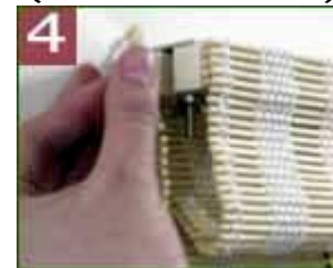
4 PUT ON RETURN (OUTSIDE MOUNT)