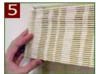
5 FINISH SHADE (INSIDE MOUNT)