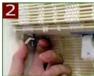
2 INSTALL SHADE (INSIDE MOUNT)