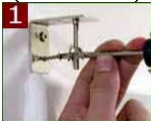
1 INSTALL BRACKETS (OUTSIDE MOUNT)