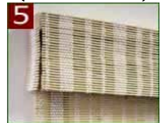
5 FINISH SHADE (OUTSIDE MOUNT)