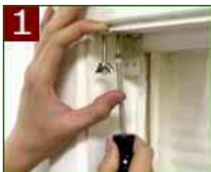
1 INSTALL BRACKETS (INSIDE MOUNT)